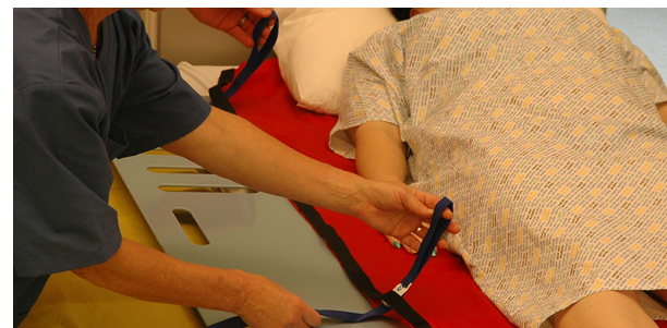
Economy Extension Straps