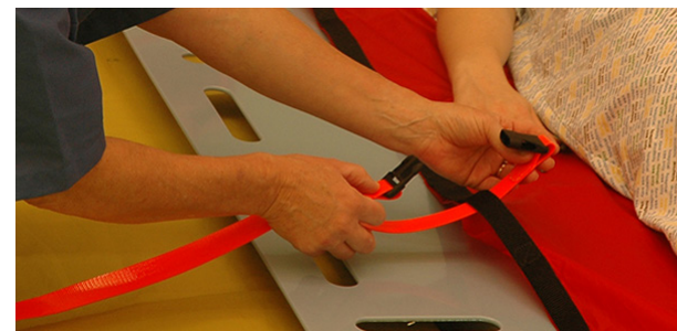
Extension Straps – Wipeclean