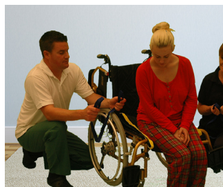
Economy Extension Straps

Sold in pairs they can also be used to help raise legs to put on shoes, socks etc and to raise a foot onto a wheelchair footrest.