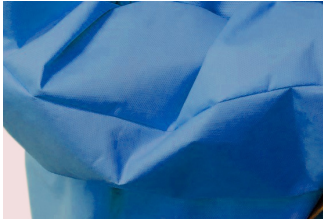
SONIC BONDED SEAMS